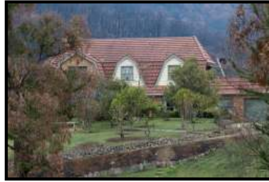
Marysville, Black Saturday, 2009

Now is the time to start planting trees and shrubs that will resist fire and can help create a lifebelt around your home.