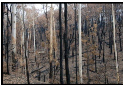
Rough-barked trees burnt to tops. Kinglake National Park