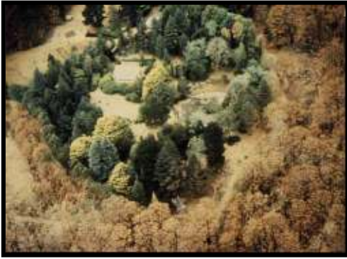
Mount Macedon, Ash Wednesday, 1983