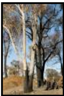
Smooth-barked trees singed. A Bendigo garden