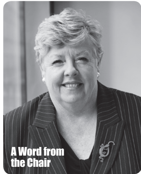
A Word from the Chair

As I continue to visit the areas and people who have been affected by the February bushfires, I am encouraged by people's resilience and their determination to rebuild their lives and communities.